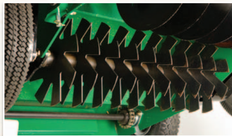
Durable cutting blades can be adjusted down to a depth of 1/2".